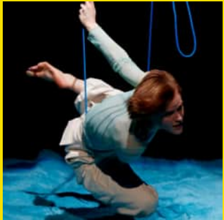
FIGURE IT OUT 24 to 30 June 2024 Showcase figure theatre